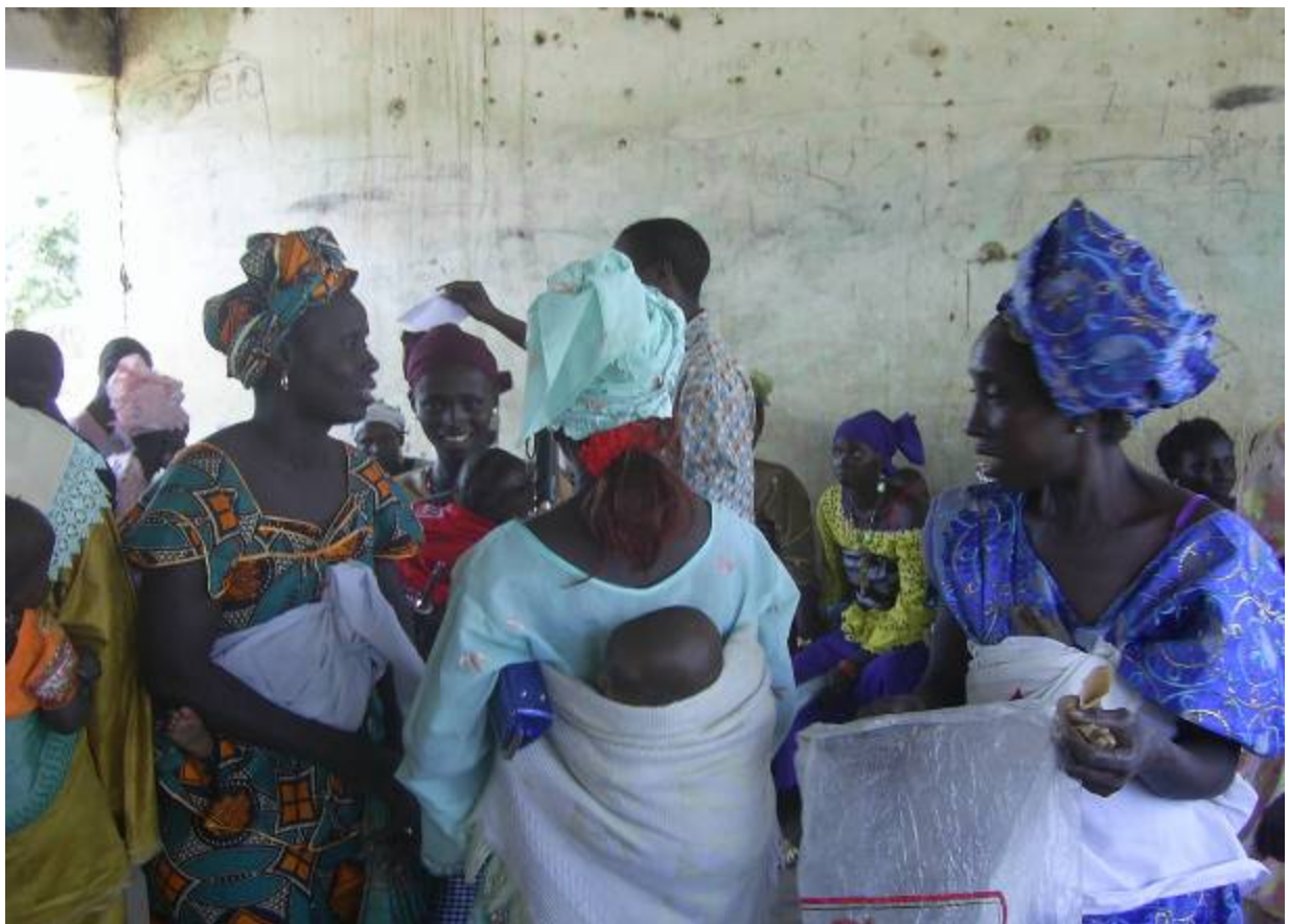
Mothers waiting to receive their Nets

Free Net Distribution Report 15 th – 20 th January 2008