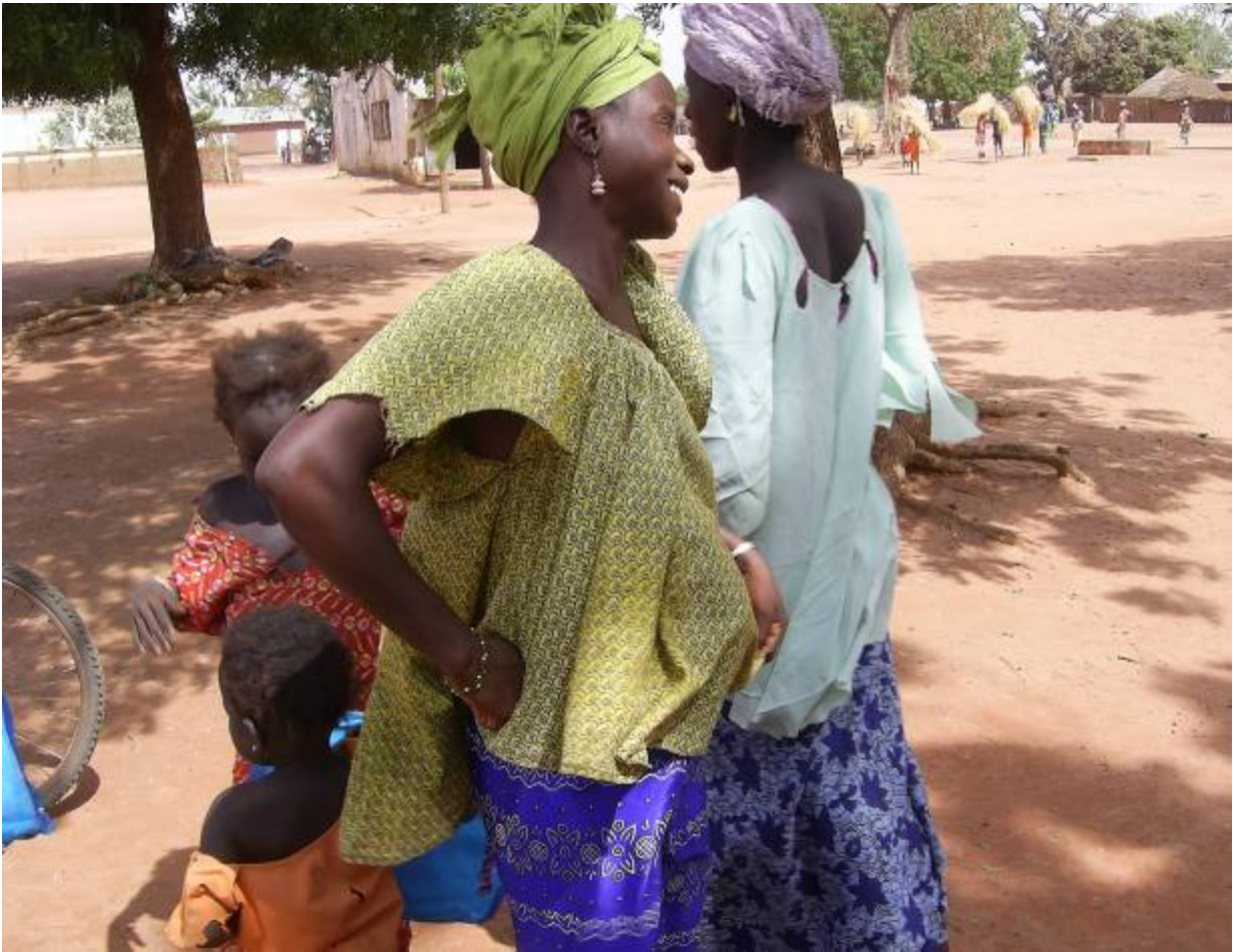
A Pregnant Women about to received ITN

The bed net distribution targeted all six districts in the North bank region namely Lower Nuimi, Upper Nuini, Jokadou, Lower Badibou, Upper Badibou, and Central Badibou, while the IMCI house to house sensitisation targeted only three districts in North Bank West Region. A total of 4,599 under five children and 1,771 pregnant women were the target for the exercise. However, due to the increase in the Nets received, the total nets distributed are 4,730 for children under five years and 1,755 pregnant women. The total number of bed nets distributed to both children under five and pregnant women totals to 6,485 ITNs which is distributed in one hundred and seventeen villages.