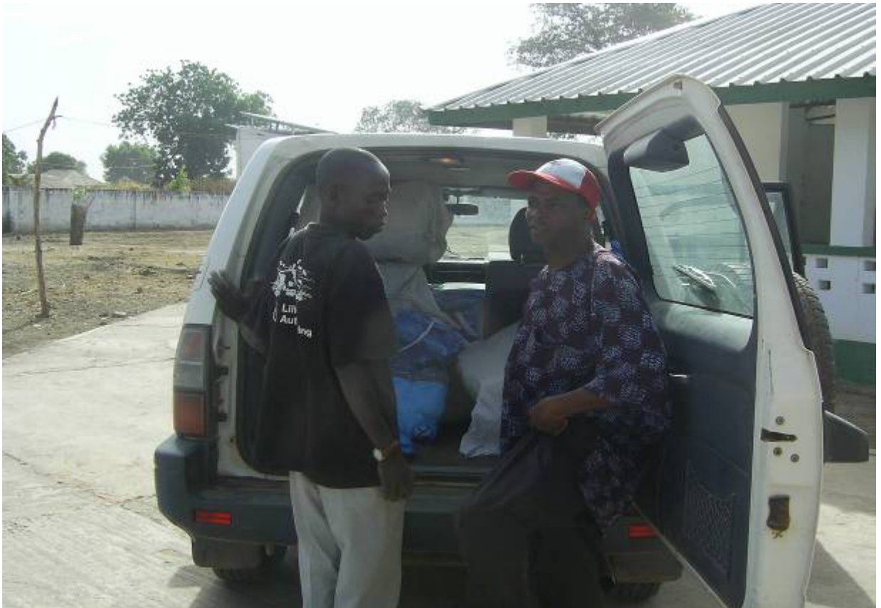
The only GRCS vehicle available during the distribution