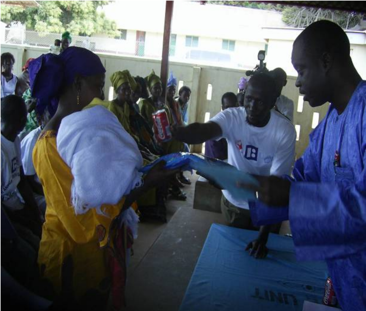
The Secretary of State for Health handing over the first Bed Net during the launching ceremony

Gambia Red Cross and other GRCS Staff, local government authorities, Red Cross Volunteers in North Bank, Community Health Nurses, Media representatives from GRTS, Community Radios in NBR, private radios in the greater Banjul and the members of the print media and community members.