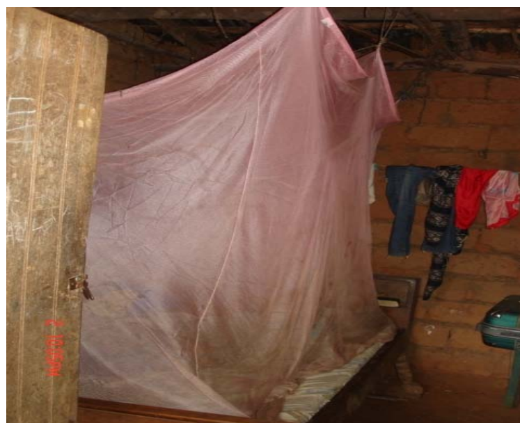
An ordinary net (not treated) in a house in Manji health area