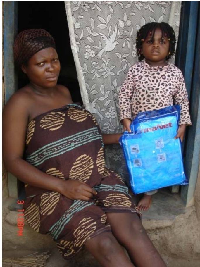
A pregnant woman with her little child showing the net received and kept awaiting the incoming baby