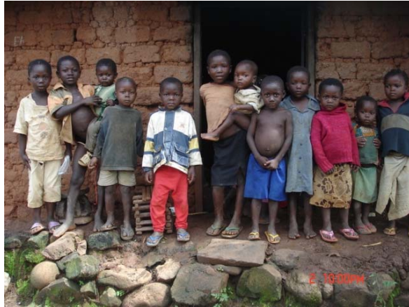
A group of children snapped by the evaluation team in MANKANNIKONG Health area