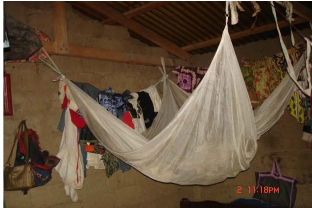
Net mounted in a house without roofs in Nforya Health area