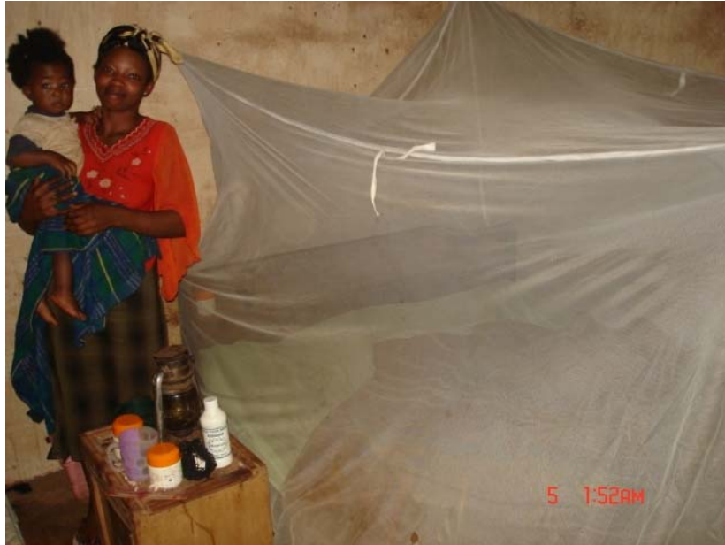
A mother and her daughter near her LLIN well installed in Akofungha health area