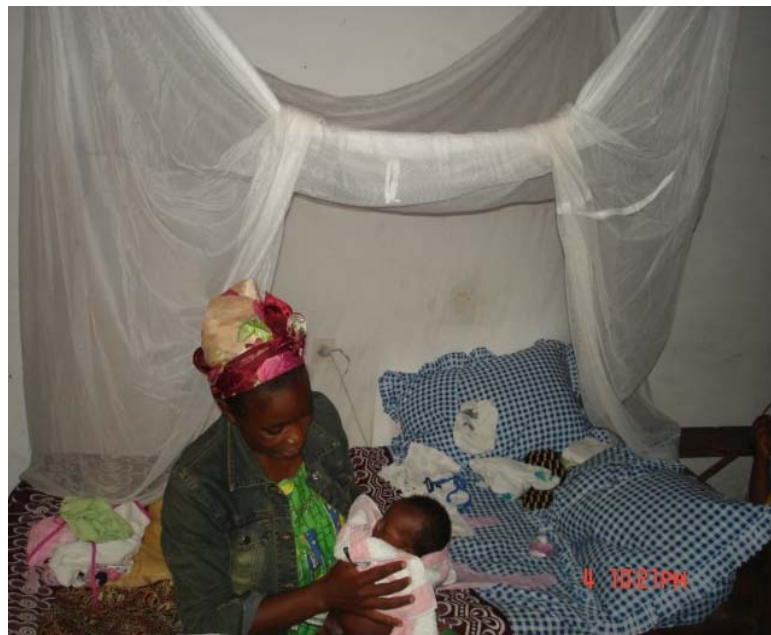
A mother with her Baby in from of the bed with a LLIN installed (Mambu health area)