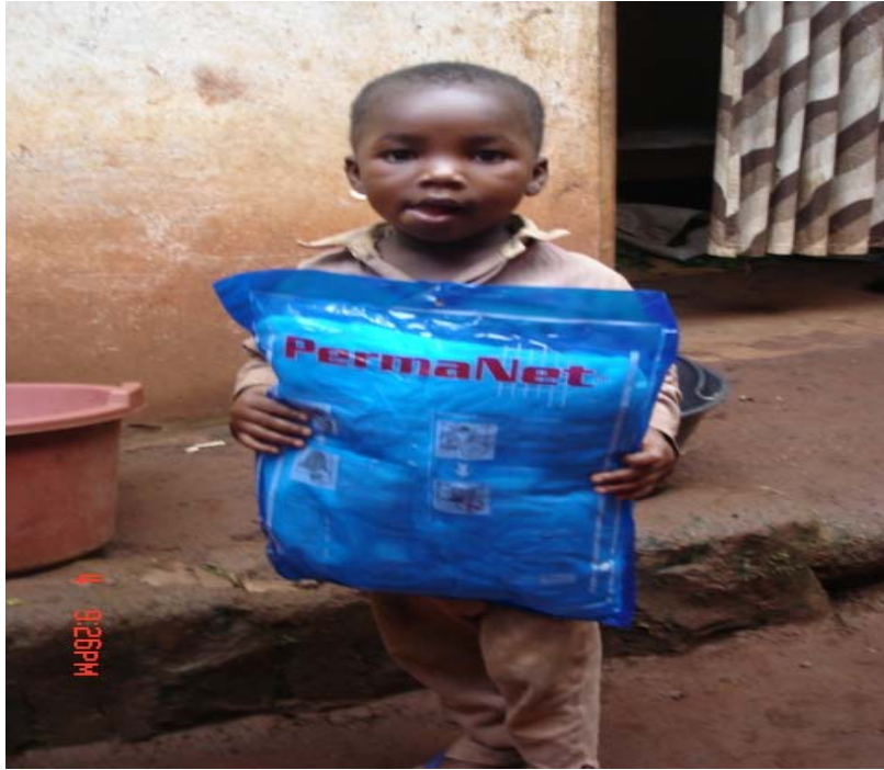
A little baby boy holding his own net still not mounted in Mundum health area