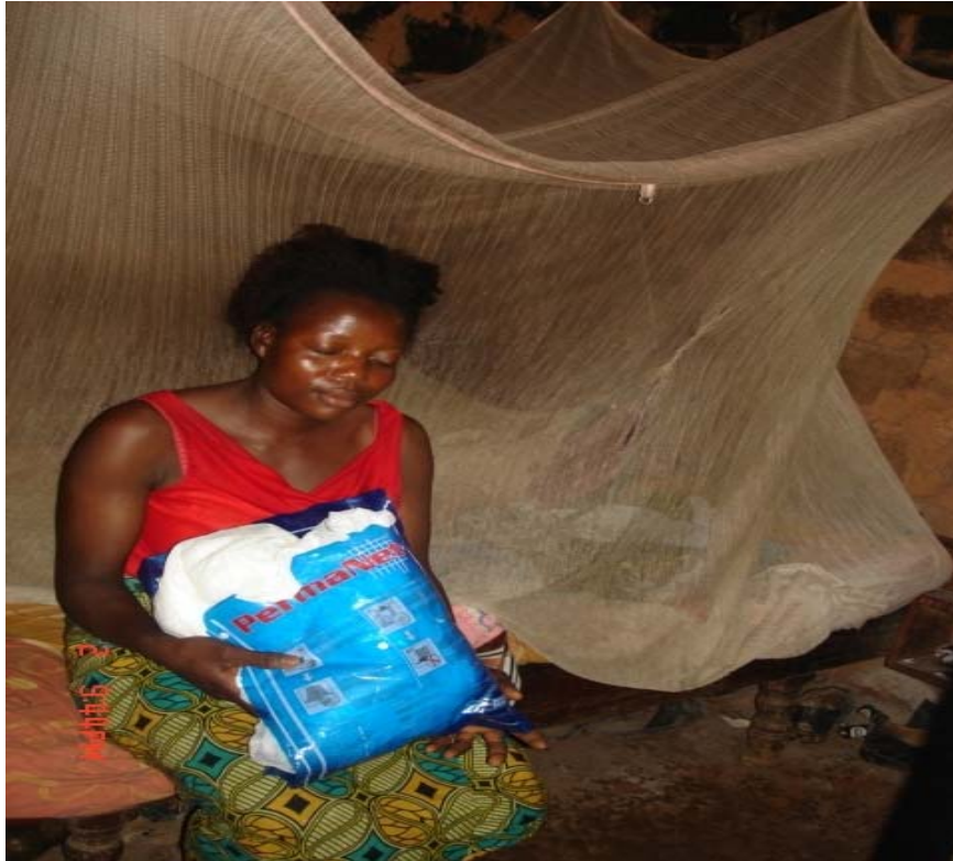
A mother in the room with an old net (not treated) installed and the WSM LLIN still in the package in Mbakong health area