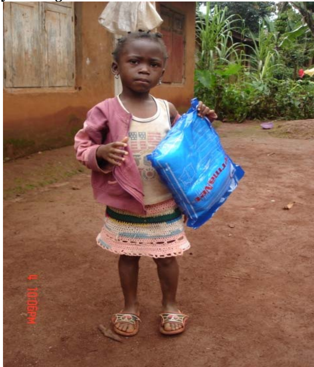
A little baby girl holding his own net still not mounted in Mundum health area