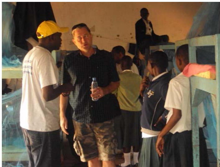
Figure 1.Shows PSI RM-Tanga & Rotarian rep in Tanga at Mbaramo Sec Sch during the hanging Rotary Nets exercise on 27 th July 2010.

And below is the summary for the entire Rotary Net Distribution exercise in Tanga region: