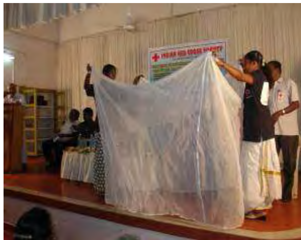
Figure 1 Demonstration of ITN during Inaugural function

Indian Red Cross Society, Kanyakumari District Branch (KKDB) organized ceremonial inaugural of Insecticide Treated Nets (ITN) distribution on 30 th Aug 2008 at Nagercoil, Kanyakumari. Distribution of 90 ITNs to 90 beneficiaries was ceremoniously done before distribution of 20,000 ITNs in 15 communities of Kanyakumari district, under the Tamil Nadu Integrated Recovery Program (TNIRP) of Indian Red Cross Society, Kanyakumari District Branch, supported by American Red Cross.