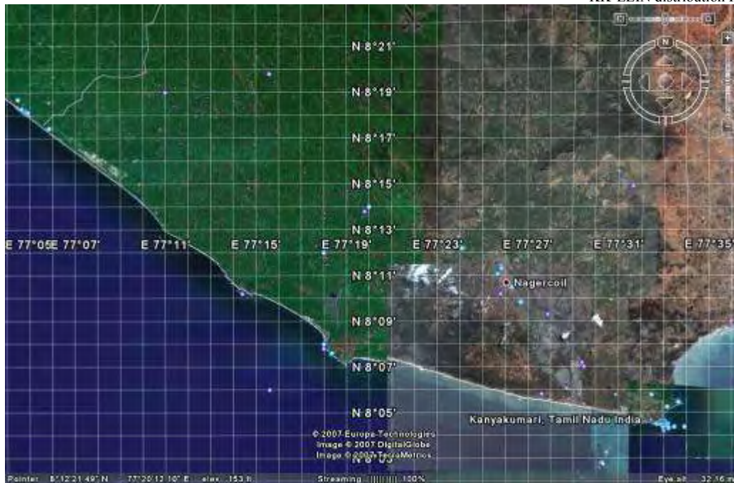
District Kanyakumari Tamil Nadu Grid Map (E 77° 5' 77° 36', N 8° 03' and 8° 35' )