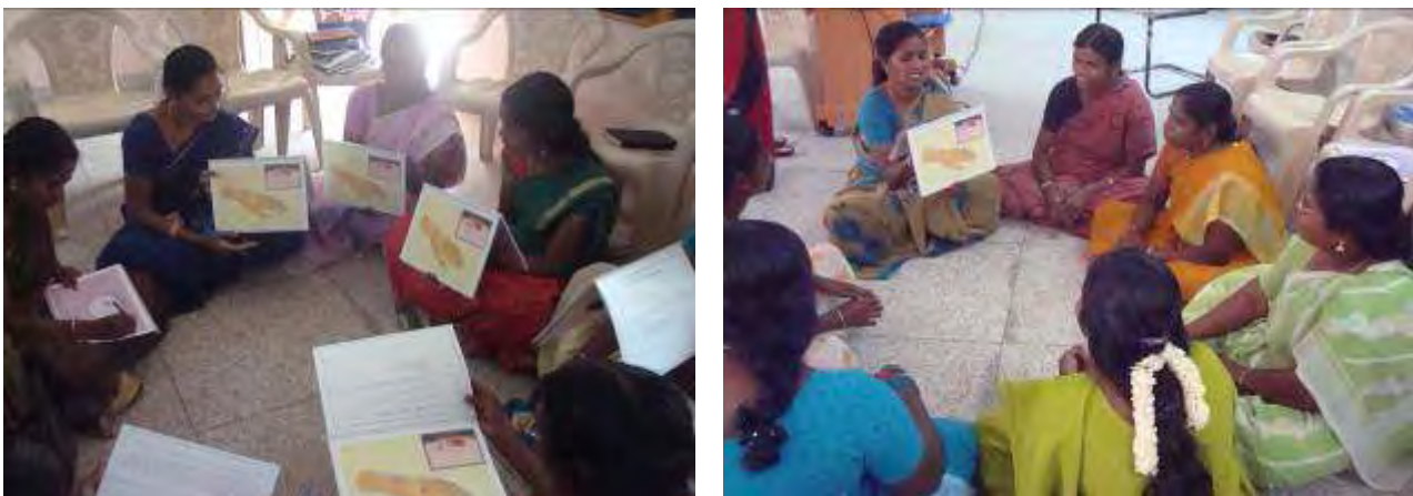
Figure 3 and 4 IPTs practicing the Malaria Cue Cards in CBHFA training

69 Integrated Program Technician (IPTs-Volunteers) in these 15 communities have completed Community Based Health and First Aid Training. Rest 40 in these 15 IPTs communities will be trained by the December 2008. They have been given training on Prevention of Malaria and use of ITN in 120 minute session by using malaria cue cards and Community and House hold tool kit. These IPTs are further training the CF to use the community and household tool kit for house to house visit to follow up use of ITN and disseminate malaria prevention messages. Prevention of Malaria and use of ITN session are based on John Hopkins University (JHU) malaria prevention and awareness materials.