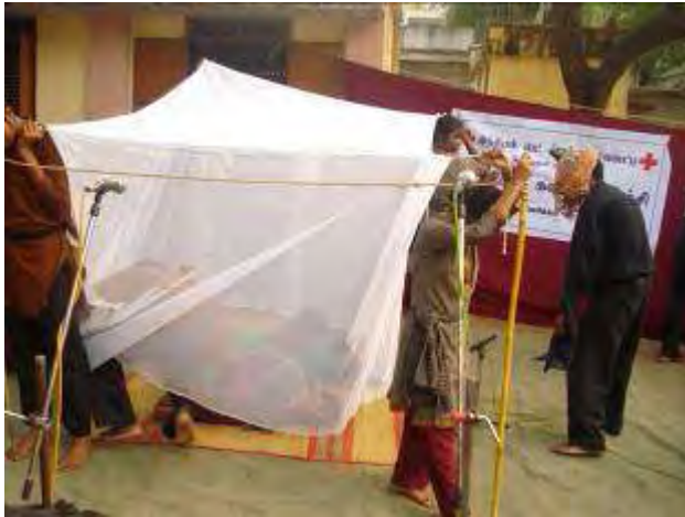
Figure 5 Demonstration of use of ITN in Traditional Media

Traditional Media enacted by the local people who are professionally trained for doing the traditional activities according to local cultural and tradition of a particular geographical region. The Traditional Media strives to disseminate information to the community through the locally and traditionally available and acceptable means. Program incorporated the widely use of traditional media to Disseminate Malaria prevention and use of ITN messages. It includes Bow Song (Villu Paatu) is an ancient form of musical - story - telling art of southern Tamil Nadu. Villu Paatu has been very popular in Kanyakumari and other near areas. Other traditional method which has been used are Parai Adi , oyil attam, Kolattam (traditional dances).