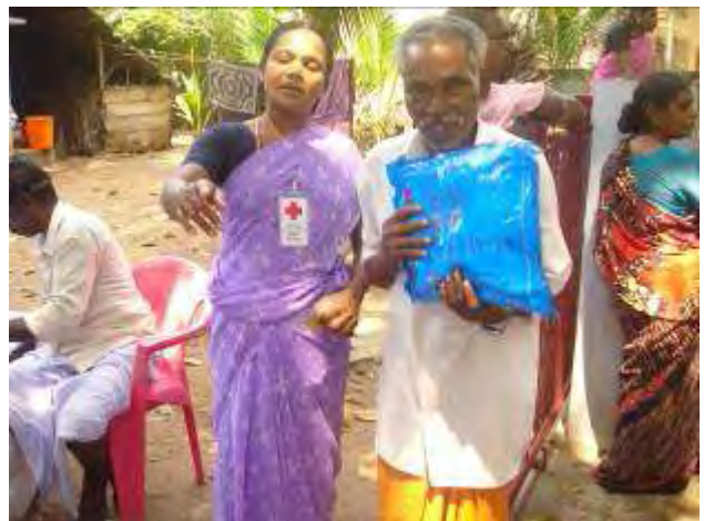
Figure 13 Volunteer and Beneficiary after distribution