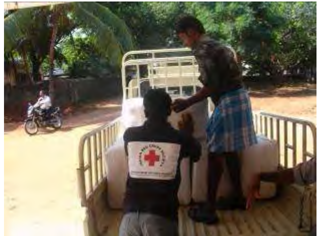
Figure 10 & 11 ITN loading from IRCS office for distribution by IRCS Staff