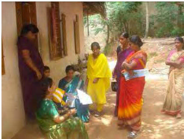
Figure 8 Volunteers doing Household listing in village

A standard form was prepared for household listing. The form contains the information's of address of the house, head of the family, size of the family, no of member under the age of 5, date of distribution, signature, name of the lister, date of listing and signature of the community committee leader. After orientation the listing in every community was done by IPTs and CFs, which was verified by the community committee, and IPS