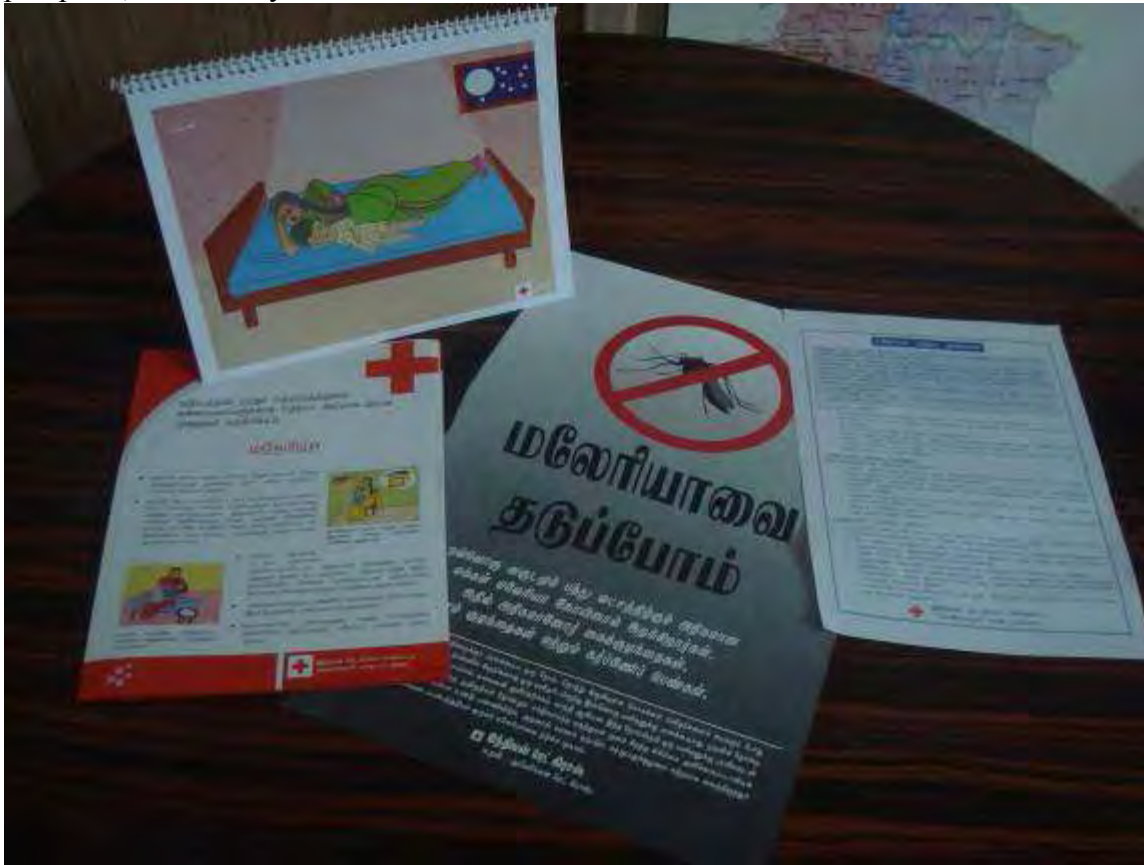
Figure 7 IEC materials on Malaria Prevention and Promotion of ITN

2.9 IEC materials: Various materials other than training manuals have been developed for awareness and dissemination of messages like Malaria Cue Cards, Poster, pamphlet, community and household tool kit.