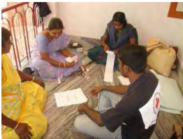
Figure 9 Volunteers Preparing token with IPS

The volunteers prepared the token with household serial number, name of the head of household and IRCS seal. Tokens were distributed through CF to every household 1- 2 days before for ITN distribution. Distribution time has been allotted as per the number of Household/token.