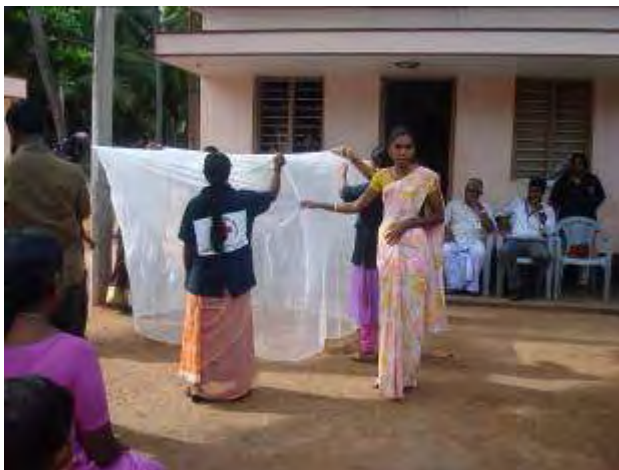
Figure 12 Demonstration and explanation before ITN distribution by IPS

Before every distribution the common demonstration for hanging and proper use of net was done by the project staff and volunteers to all the beneficiaries. The volunteers had started following up the proper usage of nets by conducting house visits. They have been informed to secure the nets from any damage likely to cause by rats etc.