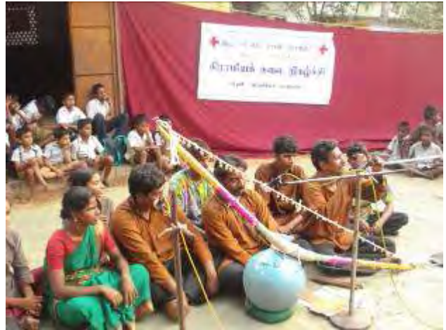
Figure 6 Malaria Prevention message dissemination through Villupattu in Traditional Media