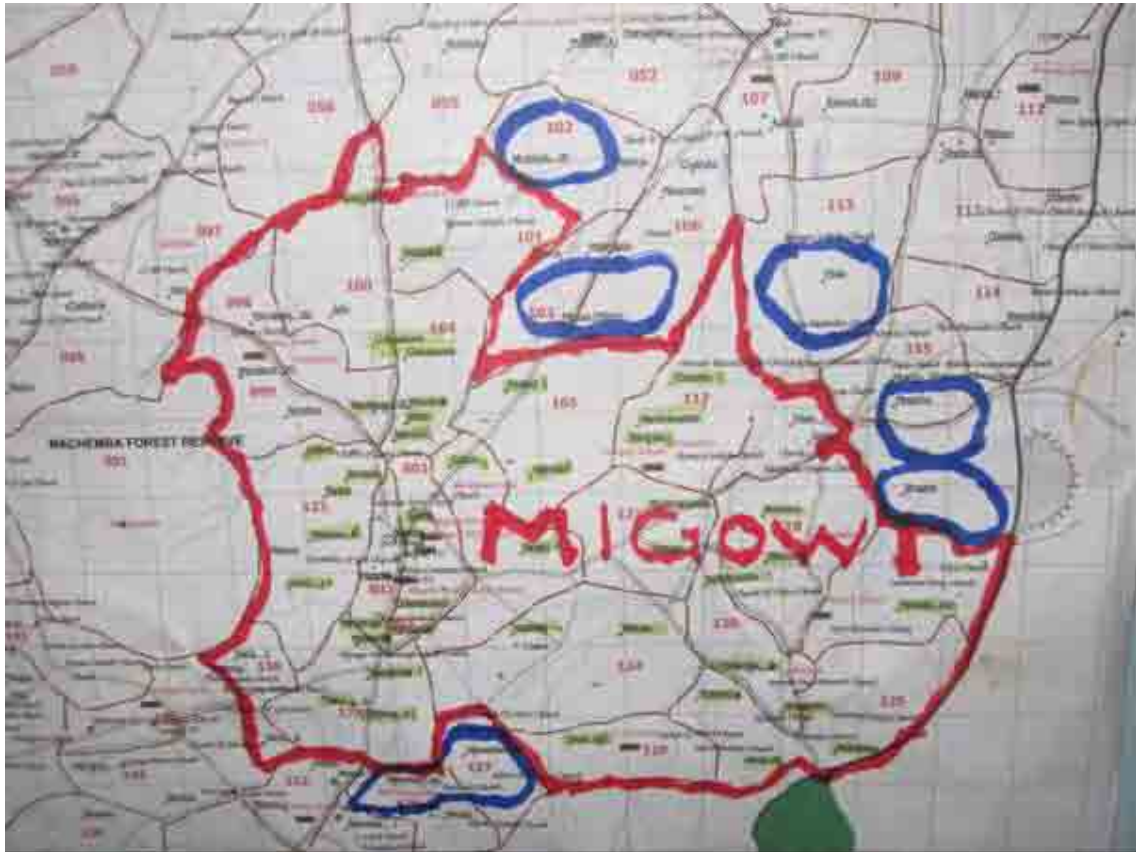
Annex 1: Map of Phalombe showing Migowi catchment area (circled in red) and some villages belonging to Kalinde and Phalombe Health Centre catchments (circled in Blue)