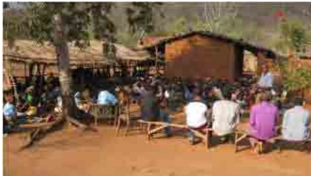
PMCP Director briefing community members at Maliko Village prior to net distribution exercise.

A roll-call of all registered beneficiaries was made to insure that all those registered were indeed members of that village. During the mobilisation meetings, distribution process was explained to the beneficiaries and other community members. Health talks focusing on the importance of sleeping under an ITN and maintenance of ITNs were also made at the mobilisation meetings.