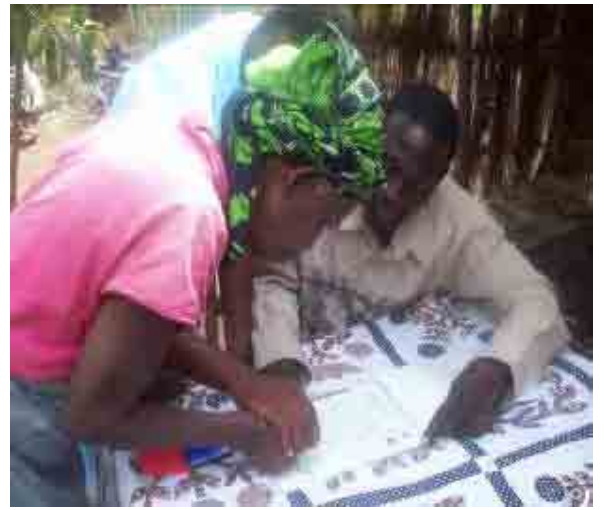
Left: A pregnant mother walks away after receiving her net. Right: An elderly woman is assisted to sign for her net.