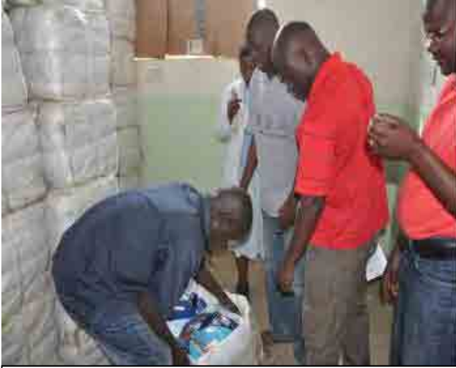
Distribution team members counting ITNs at the store

The District Commissioner and the DHO were also involved in writing a communiqué to the Malawi Revenue Authority requesting for duty waiver for the 9,600 LLINs. The Malawi Government had introduced 10% duty on LLINs effective July 2009. The DHO also provided a warehouse where the nets were stored, health personnel that conducted registration of beneficiaries in their respective villages and the DHO also provided guidelines for household registration.