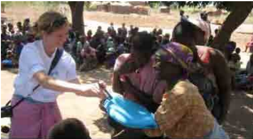
It's all smiles as the women receive their nets