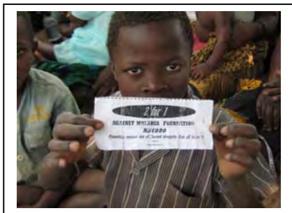
Orphans child headed family

MACOBO trace these people through their community leaders who showed us village register and were marked already with x as the poorest in the village. The areas we identified are one of the sites of abandoned estate and most of women have children who don't know their father, some parents died of AIDS pandemic. Distribution per house was also done according to people living in the house and divides number of nets so as to accommodate more people to benefit. The exercise was done through coupons we designed in order to make sure that there is total transparency and make sure that real beneficiably has get since were under pressure for bed nets due to mosquitoes during summer seasons and too rainy seasons.