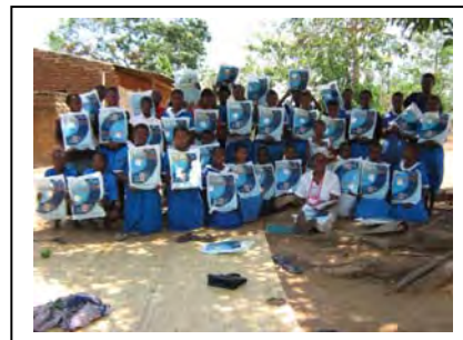
Mrs. Chidothi orphan care centre

As for aged we also separate them from others deliberately since most of them were unable to walk to the site of distribution because of physical fitness due to age. Our role was to distribute door to door as only safest way of protecting them from others who can get on their behalf resulting not to give them.