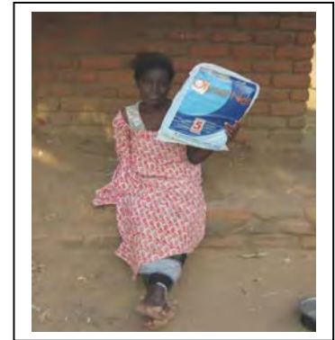
Some of disability people

The program was also work hand in hand with hospital especially to check if they provide nets to mothers with fewer than five years old, this was so because some women has a tendency of willing to have many things at once so the check of health passport book was to see if they ever received net or not. The exercise was done with health surveillance assistance. As on picture below.