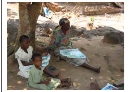
Aged with her 2 orphans.

Some of the aged beneficiably from different locations